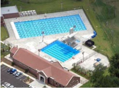
FSU Marine Science Research & Training Facility / Tallahassee, FL.